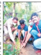
Rover crew and Ranger team members planting sapling.

Rover crew and Ranger team members also made posters to spread awareness among people and planted saplings in their nearby areas so that they can be nurtured properly. Due to the deadly pandemic and shortage of oxygen, there is a strong demand to plant saplings, conserve environment and take care of nature. If human keeps on intruding into nature and causes destruction of biodiversity, more and more problems related to human survival will surface in the future. So it is the need of the hour that nature should be taken care