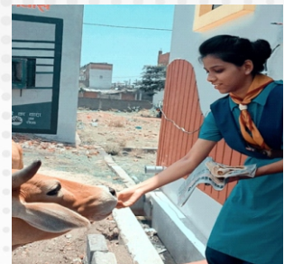
FEED THE ANIMALS CAMPAIGN (30 MAY 2021)