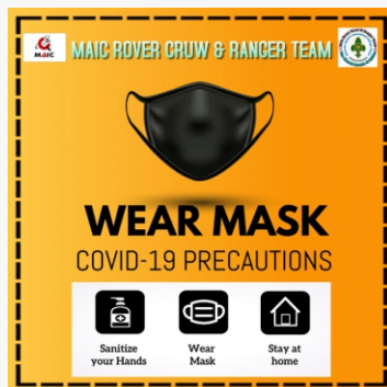
CORONA AWARENESS CAMPAIGN