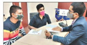
Career counselling session under way.