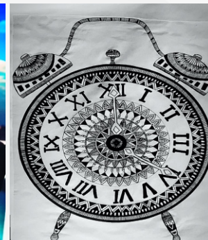
YUKTA PANDEY BBA- 1(B)