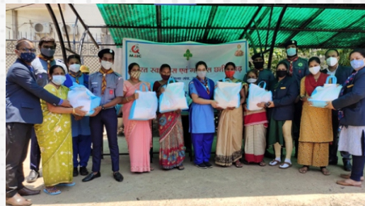
FOOD DISTRIBUTION CAMPAIGN (12 MAY 2021)