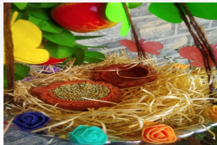
SAVE BIRD CAMPAIGN (27 March 2021)